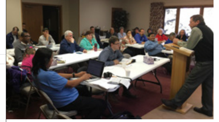
Attendees from around the state, including from Palmer, Anchorage, Selawik, Bethel and Togiak, gather to learn more on effective Native outreach.