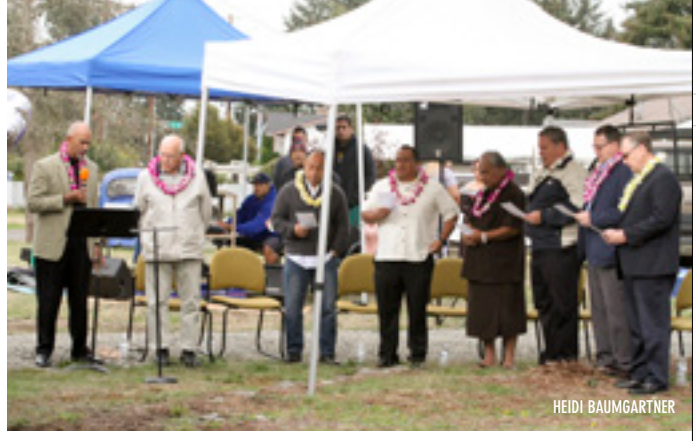
The Southside Samoan groundbreaking ceremony includes singing "To God Be the Glory" (in Samoan, "Ia Viia Le Atua").