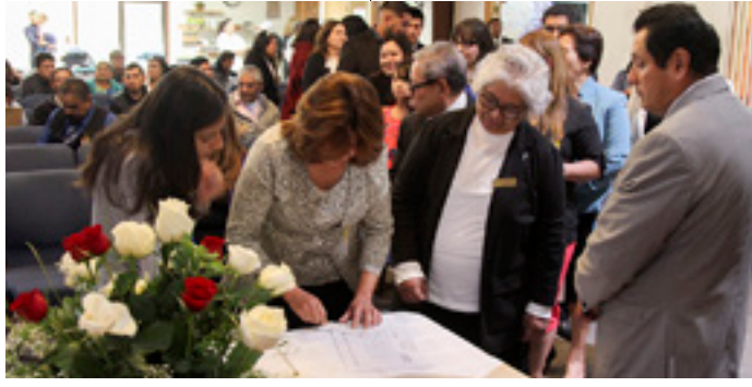
Kent Spanish members sign a roster to join the brand-new church organization.