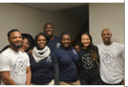
While in Seattle, visiting members of NAPS (National Association for the Prevention of Starvation) attend the afternoon Grace Tour program.

he Emerald City Community Church in Seattle was blessed to end the third quarter of 2016 with a visit from the Grace Tour on Sabbath, Sept. 24. Formed by