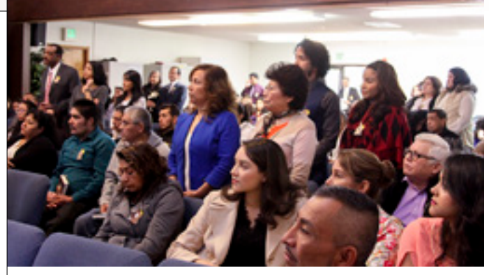
The church planters of Kent Spanish Church stand in the congregation. These individuals are actively sharing their faith and forming new friendships in the community.

On Sabbath, Oct. 29, the congregation moved from "company" status to a full