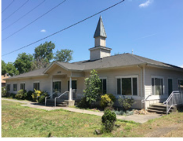
Nuevo templo en Eugene, Oregon.

Vale la pena decir que con la Iniciativa Juntos Podemos, no sólo se ha logrado adquirir dos templos Hispanos en la Conferencia de Oregon en 3 años, sino que se ha logrado