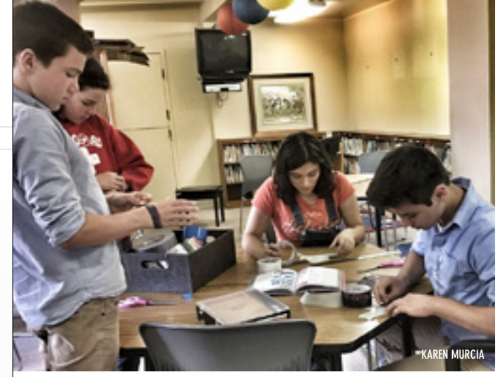
Puget Sound Adventist Academy and Kirkland Adventist School students create together in the Maker Space.